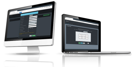
Configuration and Control via web browser interface

VIEWSPAN Solo® is an ideal networked display system for auxiliary monitors, spot monitors, retail displays, reception desks and manager's offices.