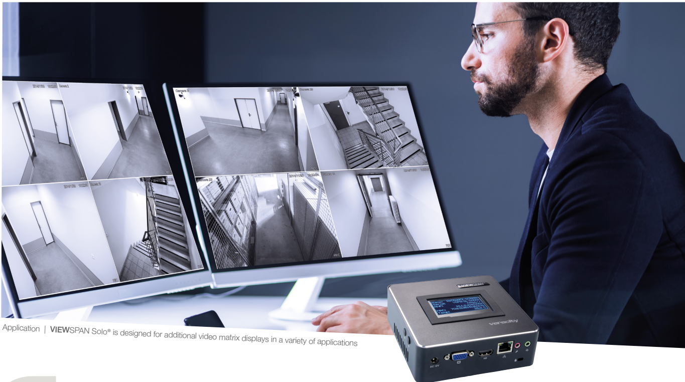
Application | VIEWSPAN Solo® is designed for additional video matrix displays in a variety of applications